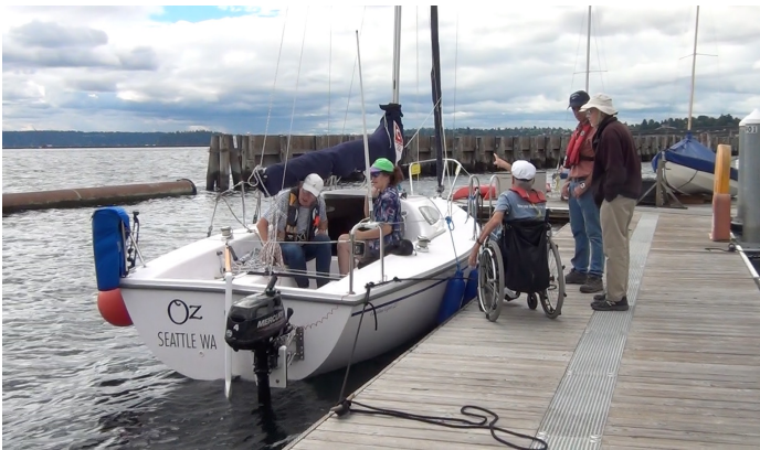
The Crew Inspecting a Capri 22