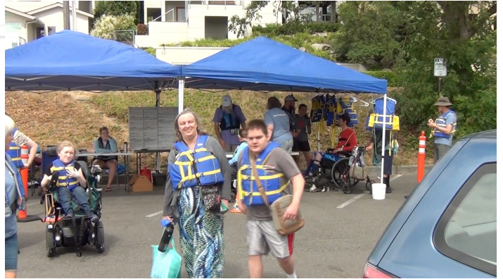
The Start of The Sail Day

Footloose is happy to announce that sufficient funds have been committed to allow us to purchase a new, or nearly new, Capri 22. This will allow us to retire one of the Columbias which, although they are great boats for our purposes, are getting a little tired. The Capri 22 is a higher performance boat than the Columbia and will allow for more lively sails. With an easily reefed main and self-furling jib it can also be tamed down for more comfortable rides.