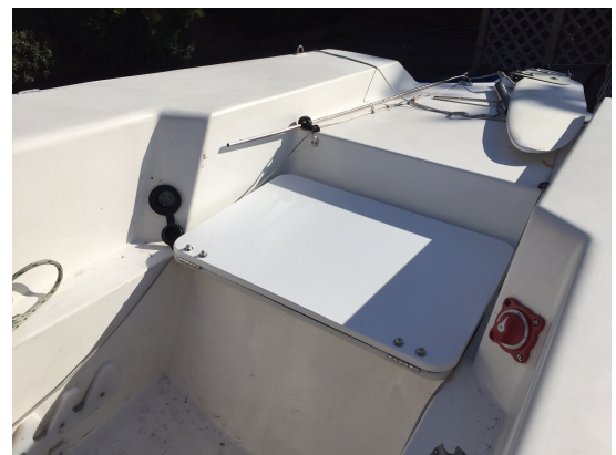
Martin 8 Bench Seat