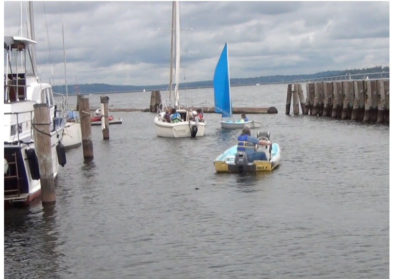
Herding Cats at the start of a sail day