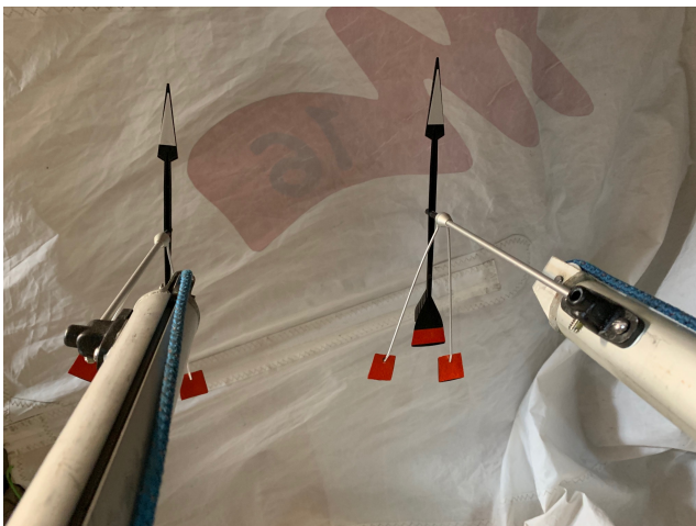
New View from the Martin Cockpit

In our continuing efforts to improve the sailing experience in the Martins (and to try and keep up with the carefully cared-for Access dinghies) several modifications have been made. Windex wind indicators have been added to the tops of the masts so that we can finally find out where the wind is coming from on those light wind, high boat chop days. The rear seat of Martin 8 has been replaced with a flat seat. This will give the volunteer a little more room behind the big black seat. Bags have been installed in the cockpits to keep the batteries more accessible and out of the way.