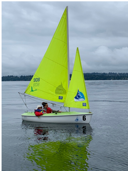
It sometimes takes a while...