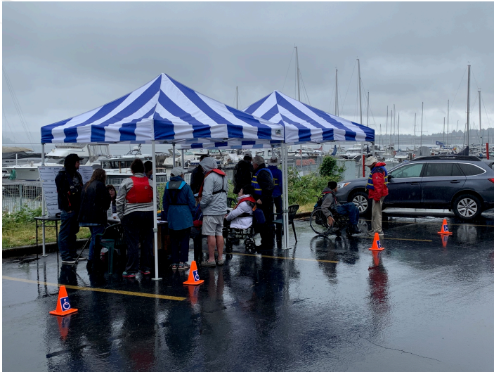
Some sail days start out a little wet...