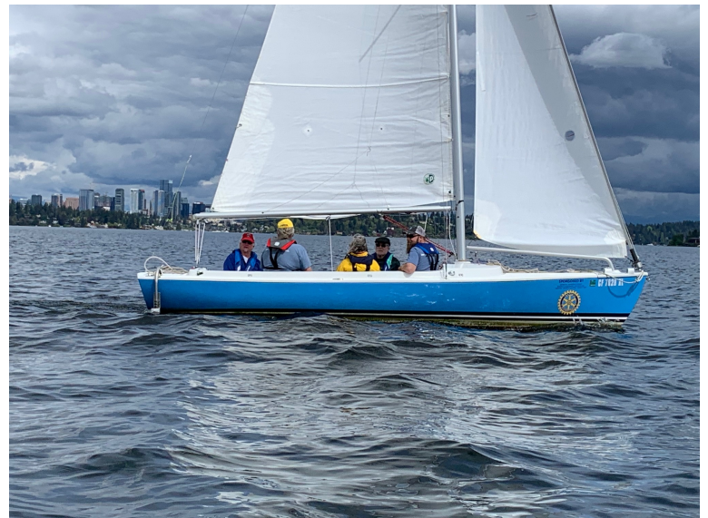
but eventually the winds pick up...