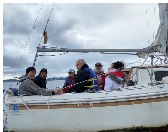
Surprise and her see-through mainsail