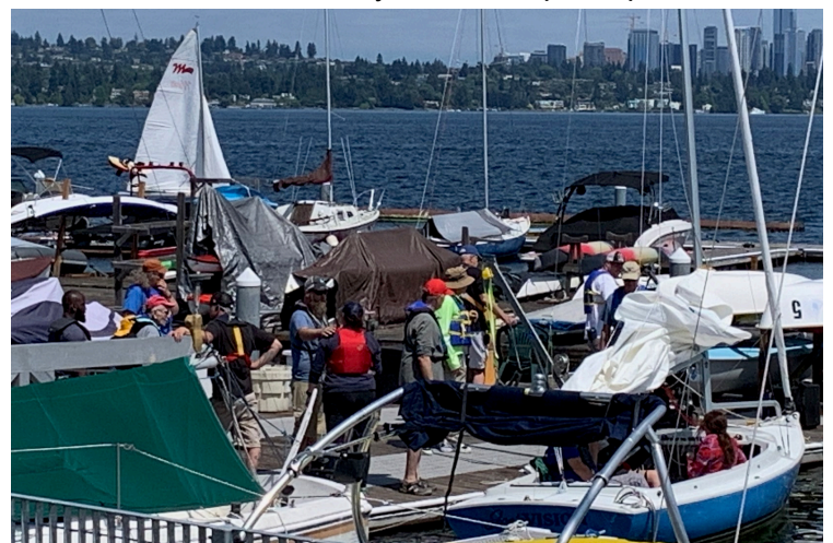
and confusion reigns.