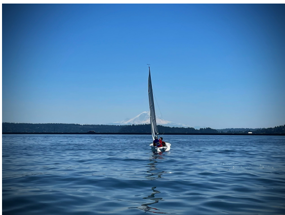
the sky clears...