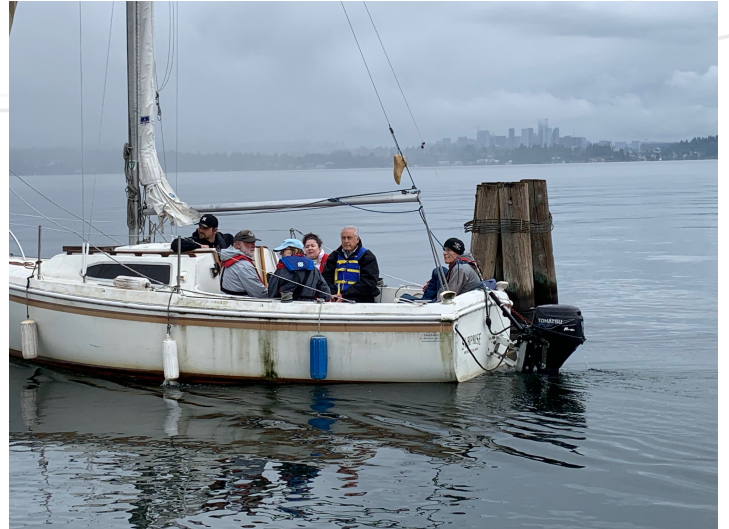
but we persevere and set out...