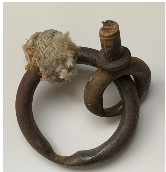
When a mooring ring goes bad, Leschi 2023.