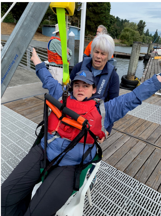
Kat demonstrates improper arm placement when being transferred