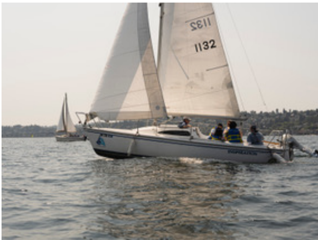
Inspiration takes off