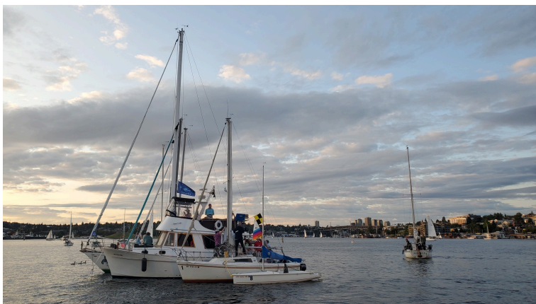
At the end of the day

With sometimes over a hundred boats turning out on a very tight course, rules 3,5,7,9 and 11 of the "Classic Rules" state: No hitting one-another. Rule 12 reads: Never make a duck change its course (Dodge the Duck). They are celebrating their 51 st year on Lake Union this year.