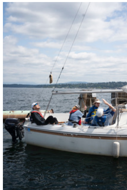
Surprise sets out